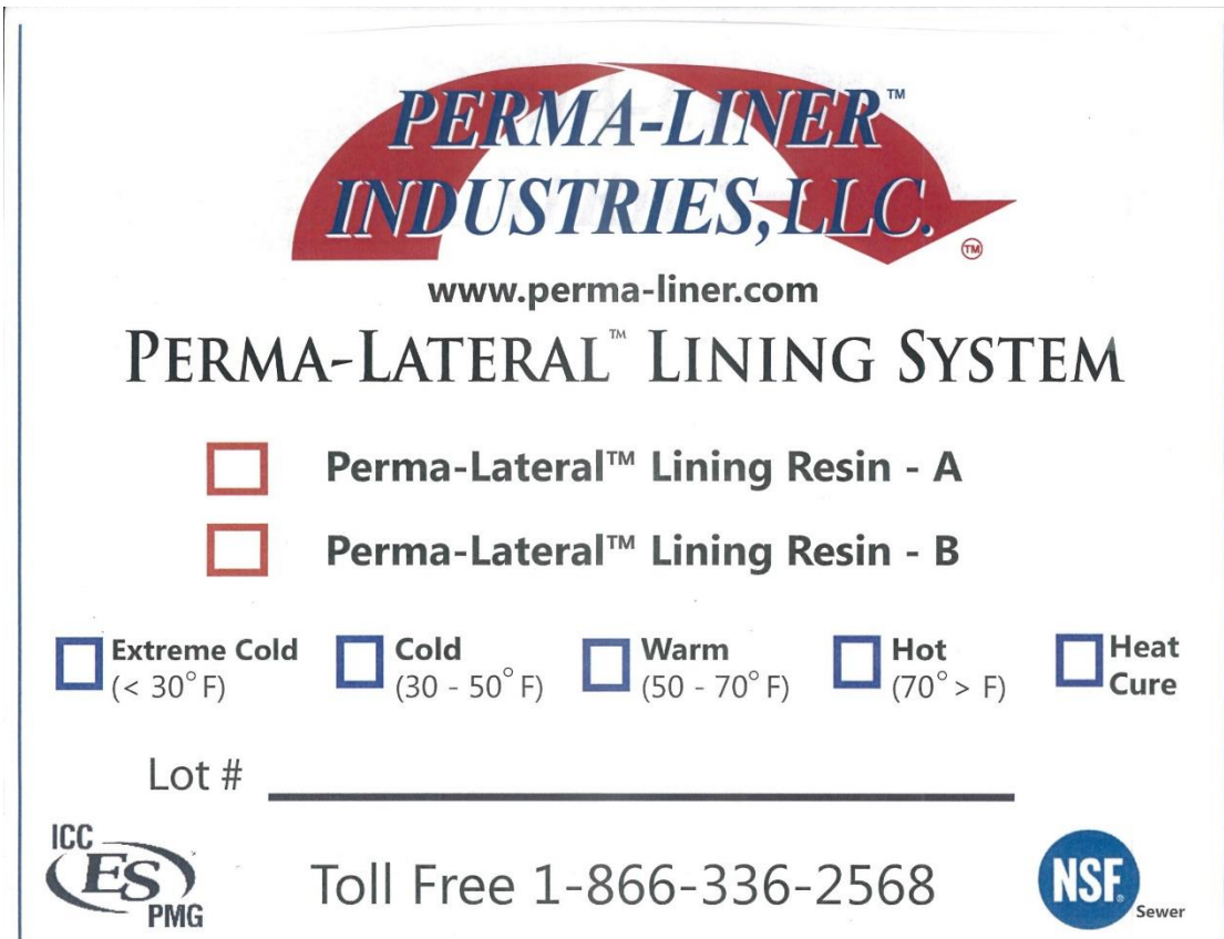
FIGURE 2—RESIN BUCKET LABEL