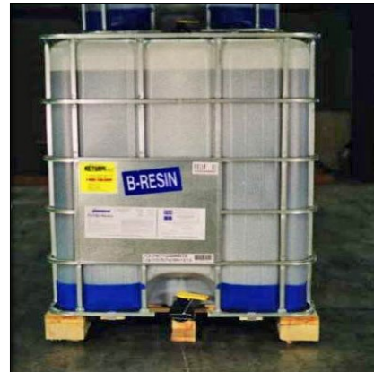
FIGURE 5—MIRACLE FOAMSEAL F-2100 RESIN NT BLUE TOTE