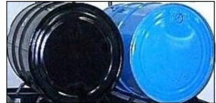
FIGURE 3—55 GALLON STEEL DRUMS