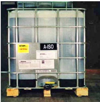
FIGURE 4—MIRACLE FOAMSEAL F-2100 ISO NT BLACK TOTE