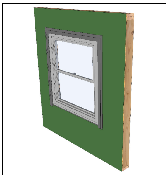
FIGURE 3 – TYPICAL FLASHING FOR WINDOW FLANGE