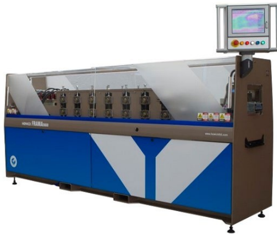
FIGURE 2—HOWICK FRAMA 5600 ROLL-FORMING MACHINE