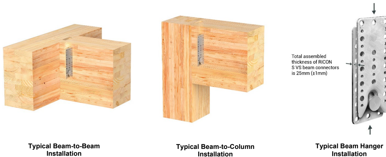
FIGURE 2—RICON S VS SERIES BEAM HANGER INSTALLATION