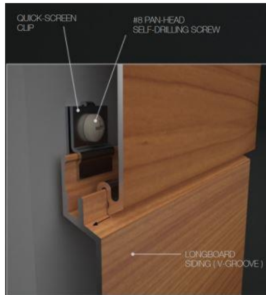
FIGURE 3—QUICK-SCREEN™ CLIP