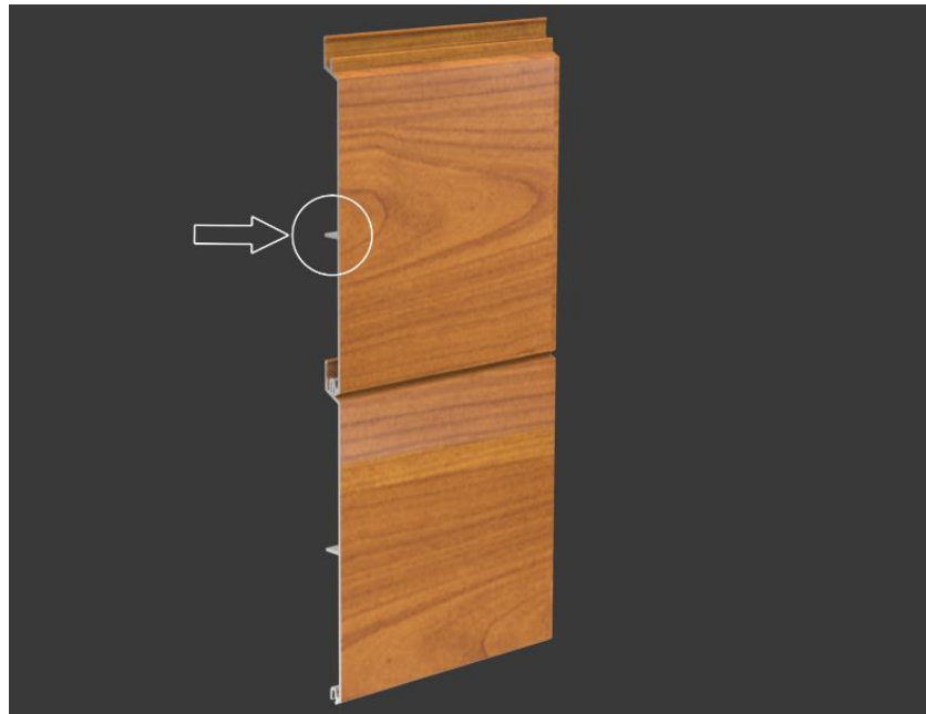
FIGURE 2—LONGBOARD SIDING WITH CONTINUOUS RIB HIGHLIGHTED BY ARROW