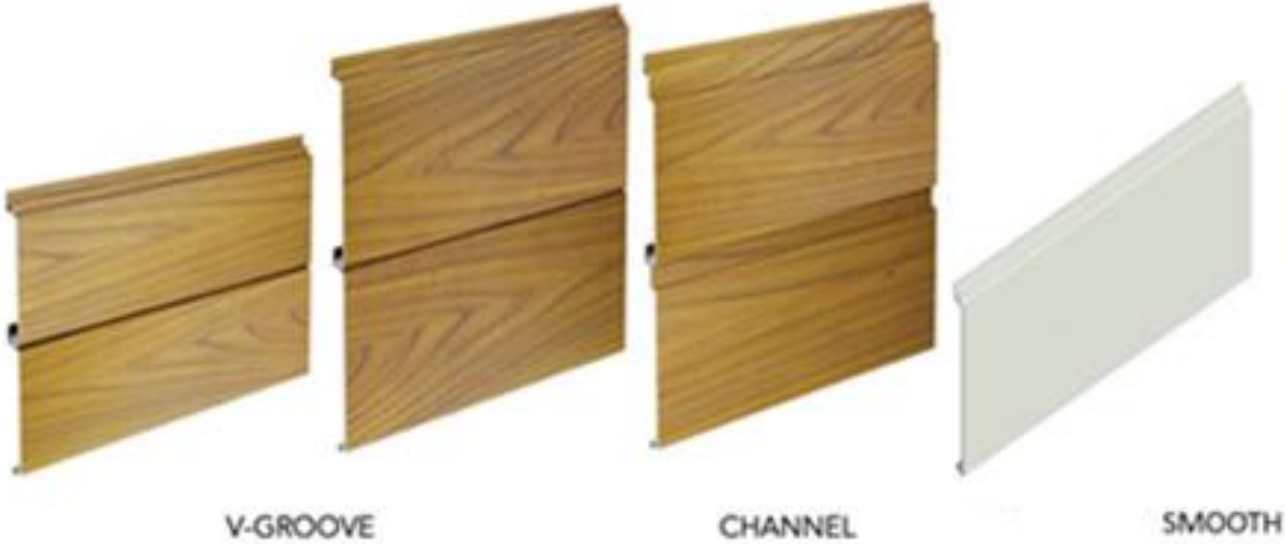
FIGURE 1—LONGBOARD SIDING WITHOUT CONTINUOUS RIB