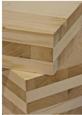
FIGURE 2—TYPICAL 3-PLY and 5-PLY STRUCTURLAM CROSSLAM ® CLT PANEL LAYUPS