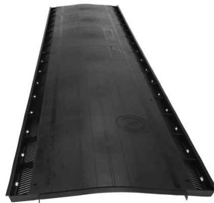
FIGURE 2—LO-OMNIRIDGE® LOR9-4