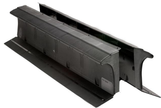
FIGURE 4—TILERIDGE® TRV-4