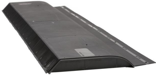
FIGURE 5—TILEINTAKE® VENT IV-9