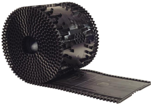
FIGURE 1—LO-OMNIROLL® LOR-30