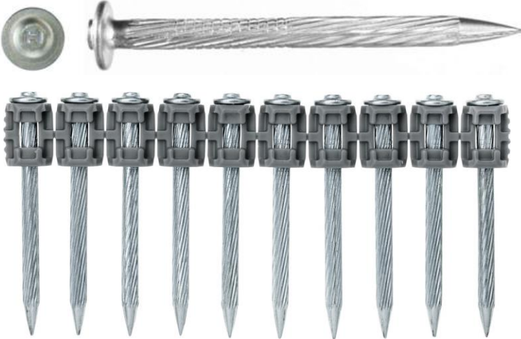
FIGURE 1—HILTI X-PN 37 G2 MX OR X-PN 37 G3 MX FASTENERS