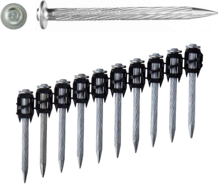
FIGURE 2—HILTI X-PN 37 B4 MX FASTENERS