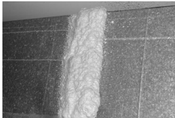
FIGURE 1—DUCT JOINT SEALING