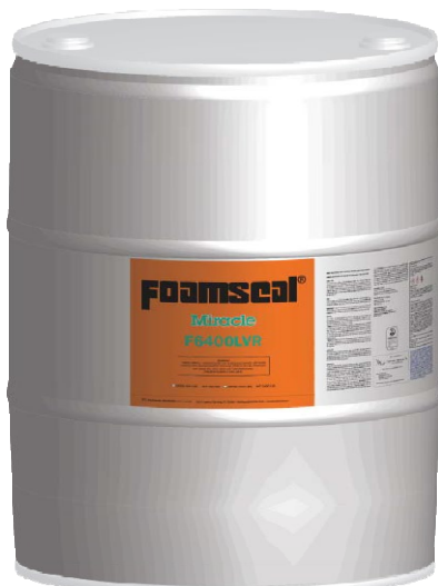
FIGURE 3 – MIRACLE® FOAMSEAL® F6400-LVR 55 GALLON DRUM