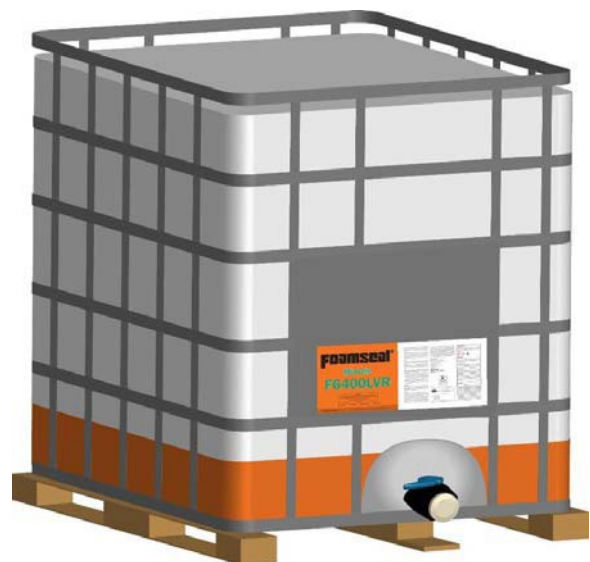
FIGURE 4 – MIRACLE® FOAMSEAL® F6400-LVR 275 GALLON TOTE