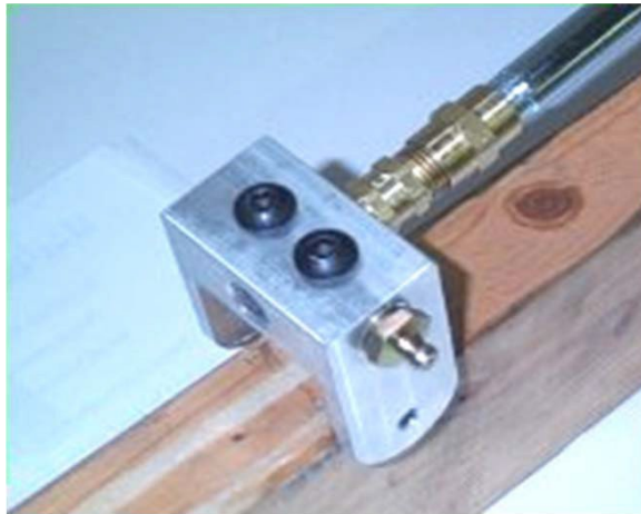
FIGURE 1 – SINGLE BEAD APPLICATION HEAD

3 Stud P/C: perimeter and center of tested specimen.